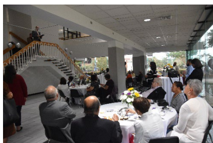
Attendees at Cheers to 25 Years: 25 th Anniversary Kick-Off Soirée on 10/12/23