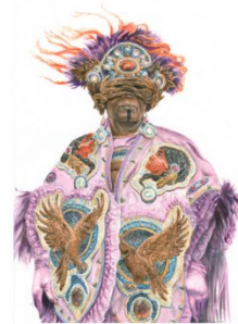
MORAN, ANNIE. "EYES OF THE GOLDEN EAGLE." 2023, WATERCOLOR.