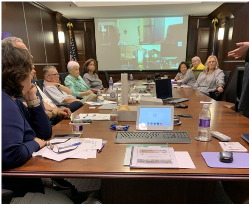
Throwback to the June 11, 2023 Advisory Council Meeting!