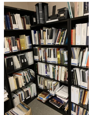
Part of the Center's Resource Library in strong need of re-organizing!