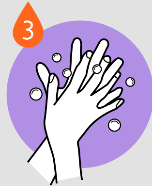
RUB PALMS WITH FINGERS INTERLACED