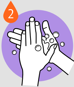
RUB PALM TO PALM