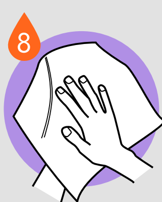
DRY HANDS WITH TOWEL