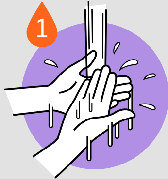
WET HANDS AND APPLY SOAP