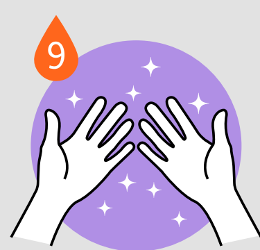
YOUR HANDS ARE NOW CLEAN!

KEEPING YOUR HANDS CLEAN IS ONE OF THE MOST IMPORTANT THINGS YOU CAN DO TO REDUCE YOUR RISK AND STAY HEALTHY.