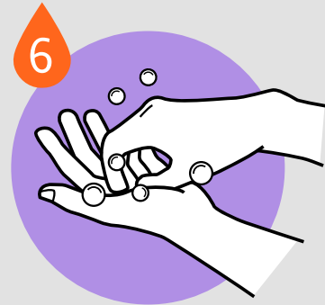
WASH FINGERTIPS AND FINGERNAILS