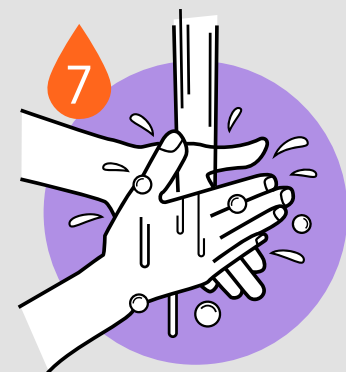
RINSE HANDS WITH WATER