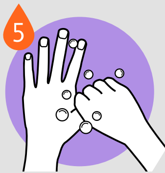
CLEAN BASE OF THUMBS