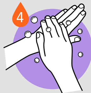
SCRUB THE BACK OF YOUR HANDS