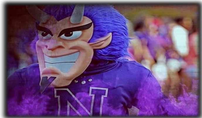
Vic the Demon

NSU also hosts the Louisiana Scholars' College, Louisiana's designated Honors College in the Liberal Arts and Sciences, and the Louisiana School for Math, Science, and the Arts.